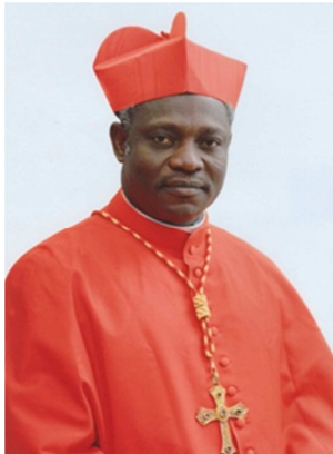
Peter Cardinal Turkson

Peter Cardinal Turkson is the president of the Pontifical Council for Justice and Peace .